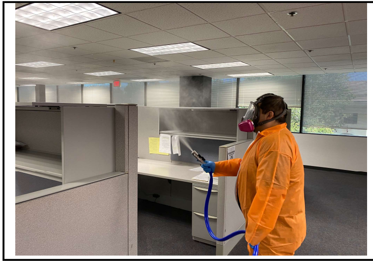
Fogging of office / workstations