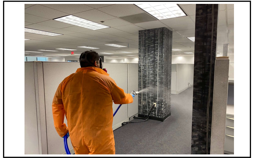
Fogging of office